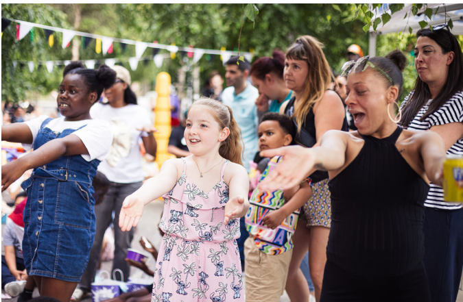
Hackney Showroom street party

Hackney Giving runners raised almost £1,000, which we combined with funding from other donors and put towards grants to fund street parties to bring people together and reduce isolation.