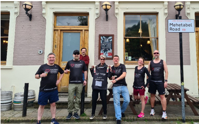
Our runners outside the Chesham Arms

Hackney Giving joined up with the Chesham Arms to field a team of runners for the 2024 Hackney Half.