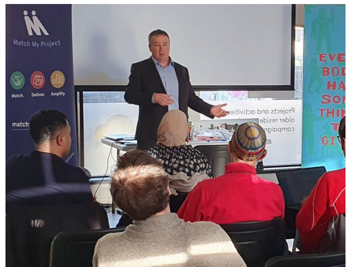
Alphatrack presentation about their involvement with Match My Project